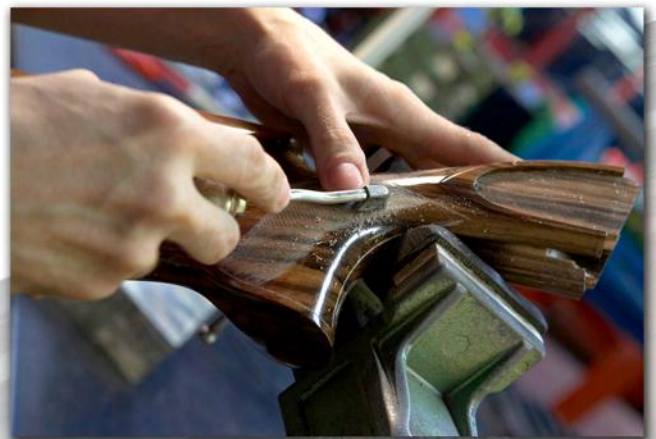
Above: Chequering is all done by hand.

If you wish to you can come back and check the finished stock on the pattern plate again to ensure the fit and feel is to your satisfaction.