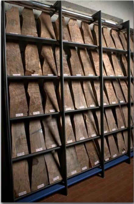
Above: Wood Blanks

Customers from all over the world visit to have guns serviced, have new stocks made or be measured for a new gun. Others just visit to enjoy a unique experience.