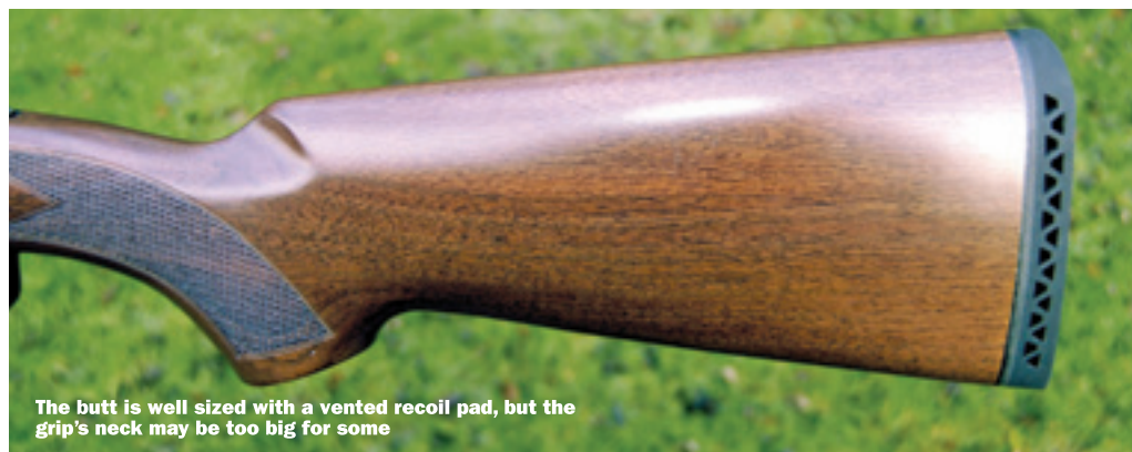
The butt is well sized with a vented recoil pad, but the grip's neck may be too big for some

Whilst the overall appearance and general feel of the 580 places it firmly in the affordable section, it's on the peg that the Rottweil starts to defy its intended market segment. Even during the initial dry mounts you soon realise how well the gun comes up and swings onto one of those thousands of imaginary birds you've plucked from the sky. Likewise, whilst others fail to live up to expectations, this gun more than delivers.