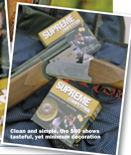
Clean and simple, the 580 shows tasteful, yet minimum decoration