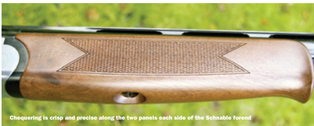
Chequering is crisp and precise along the two panels each side of the Schnable forend