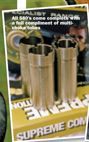
All 580's come complete with a full compliment of multi-choke tubes