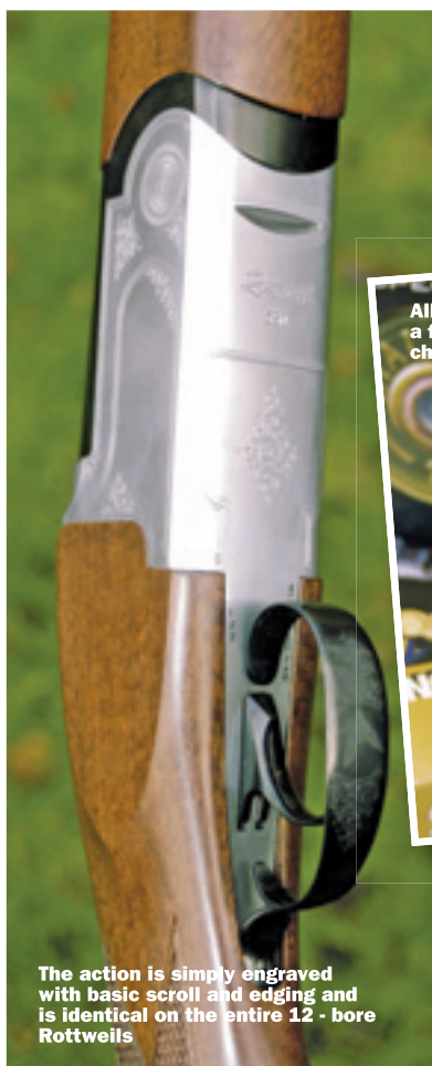
The action is simply engraved with basic scroll and edging and is identical on the entire 12-bore Rottweils