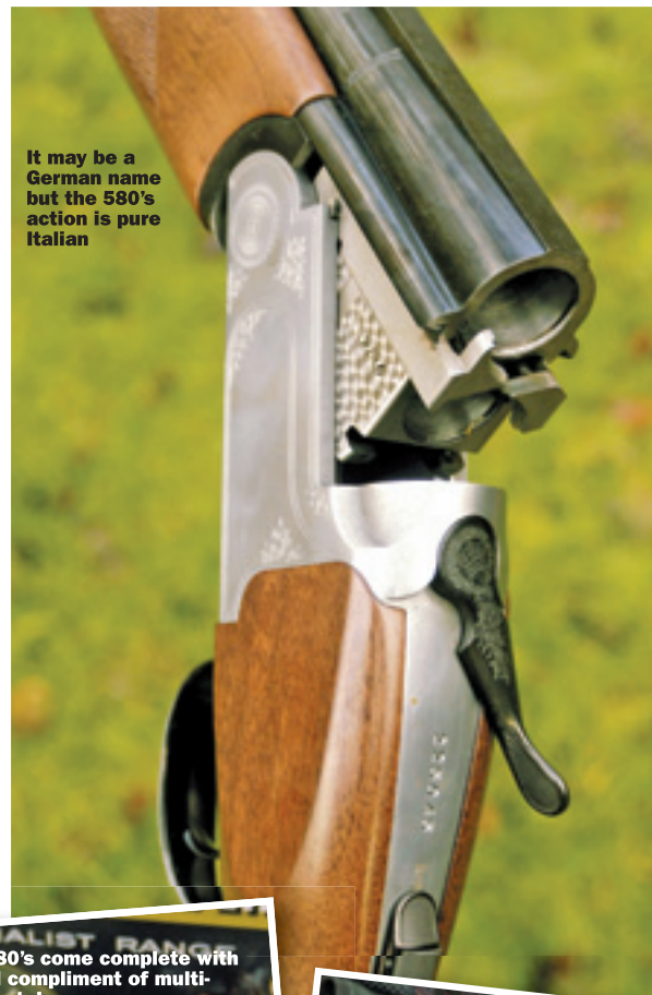
It may be a German name but the 580's action is pure Italian