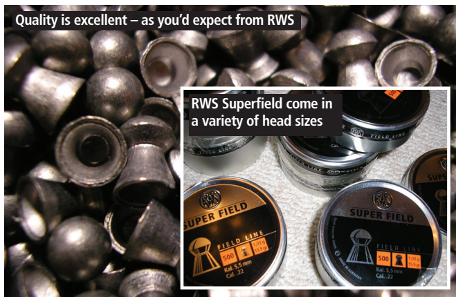
RWS Superfield come in a variety of head sizes