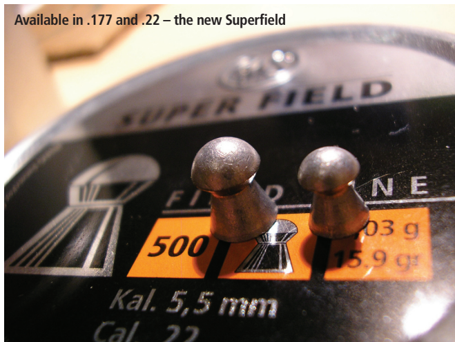
Available in .177 and .22 – the new Superfield

inspection shows little difference between the established favourite and this new product.